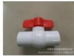
PVC 20mm ball valve