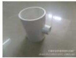
PVC 50mm to 20mm