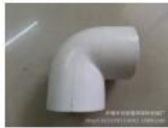
PVC 50mm right angle bend