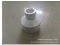
PVC 50mm to 20mm