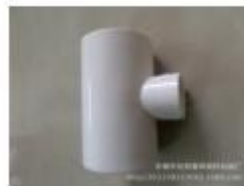
PVC 40mm to 20mm