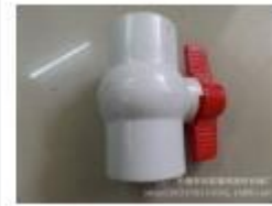
PVC 20mm ball valve