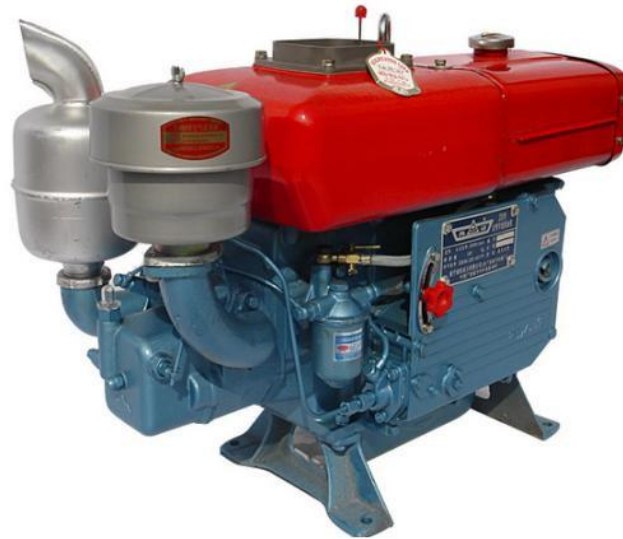
1HP-50HP diesel engine