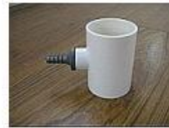
PVC 50mm to 20mm With pagoda head