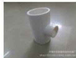
PVC 50mm to 20mm