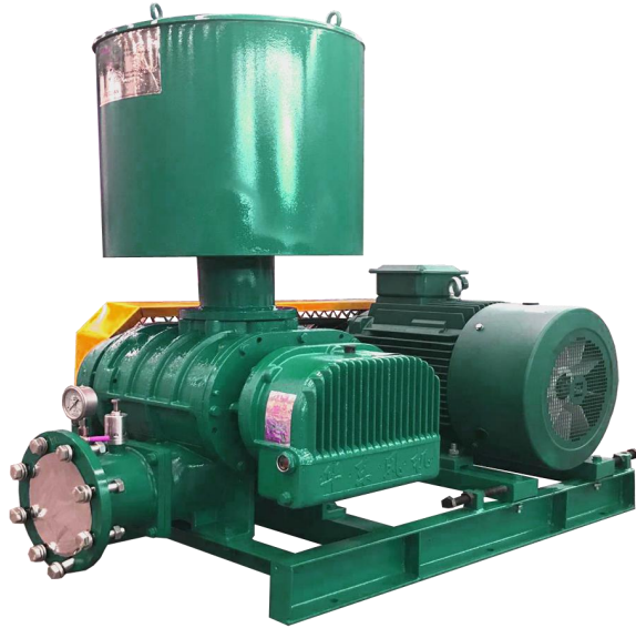
2"-12" roots blower