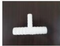
Three links 18mm 16*25