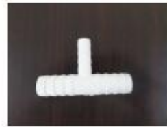
Three links 18mm 16*25