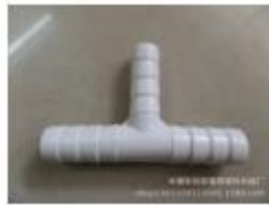
Three links 14mm 12*25