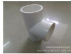
U-PVC 50mm Equal Diameter Three Links